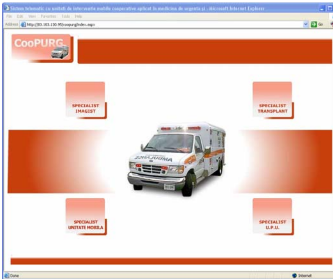
Figure 4.- Main page of CoopUrg application

In the project were applied the facilities assured by cooperative information system behavior (robots and telecommunication networks) for communication channels reconfiguration in the case in which it would dispose of communication channels.