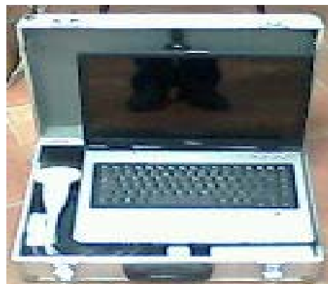
Figure 2. Independent portable echograph ensemble CoopUrg

The image of the ensamble is presented in Figure 2.