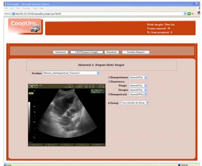
Figure 5.- Structured answer generation of the imagist specialist